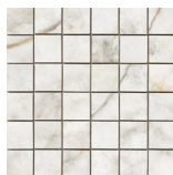
JOYCE MOSAICO GOLD PULIDO PREMIUM 30x30 SP2037 | Polissage de premiÃ©re qualitÃ© |