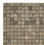
STONE MALLA TERRA MATE 30x30 ANTISLIP SP2037 | MAT |