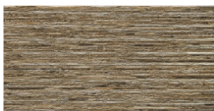
RELIEVE STONE TERRA MATE 30x60 SL G.64 | MAT | Terre Neutre