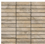
STONE TESELA BEIGE MATE 30x30 ANTISLIP SP2039 | MAT |