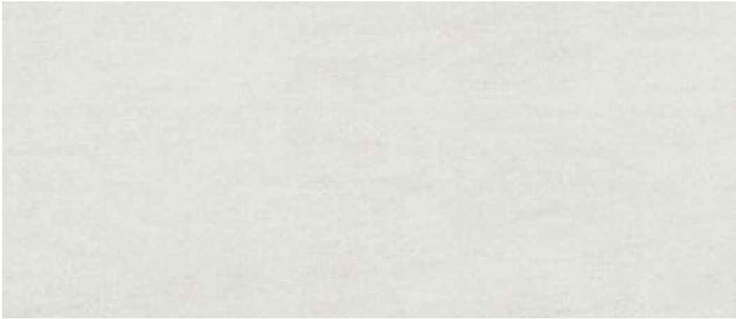
TRENT WHITE MATE 120X280 RC G.195 | MATT | Coloured body Rectified.