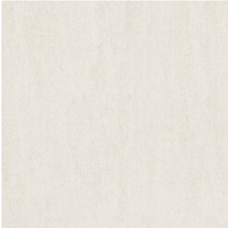
WHITE MATE 120x120 SL RC G.201 | MATT | Neutral Body Rectified.