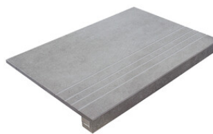
PELDAÑO GRADONE RECTO 20X120 | 20X120 / 8"x48"