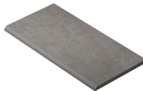
PELDAÑO ROMO 20X120 | 20X120 / 8"x48"