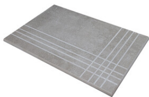
PELDAÑO ANGULO ROMO 20X120 | 20X120 / 8"x48"