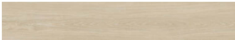
OAK MATE 25X150 SL RC G.148 | MATT | Neutral Body Rectified.