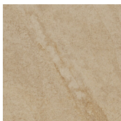
OUTDOOR ARENISCA MATE 33,3X33,3 ANTISLIP G.56 | MATT | Neutral Body