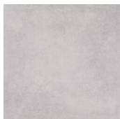
OUTDOOR CEMENT MATE 33,3X33,3 ANTISLIP G.56 | MATT | Neutral Body