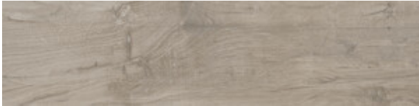
KELAYA MAPLE MATE 30X120 XS G.75 | MATT | Neutral Body