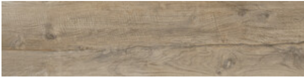
KELAYA ELM MATE 30X120 XS G.75 | MATT | Neutral Body