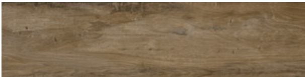
KELAYA OAK MATE 30X120 XS G.75 | MATT | Neutral Body