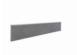
RODAPIÉ 11X75 PULIDO | 75X150 / 30"x59"