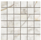
JOYCE MOSAICO GOLD PULIDO PREMIUM 30x30 SP2037 | Premium polished |