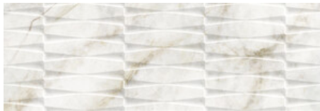
JOYCE MING GOLD BRILLO 30X90 XS RC G.112 | GLOSSY | White body Rectified.