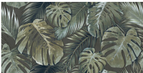
GARDEN ARECA DARK MATE 60x120 XS RC PB G.185 | MATT | White body Rectified.