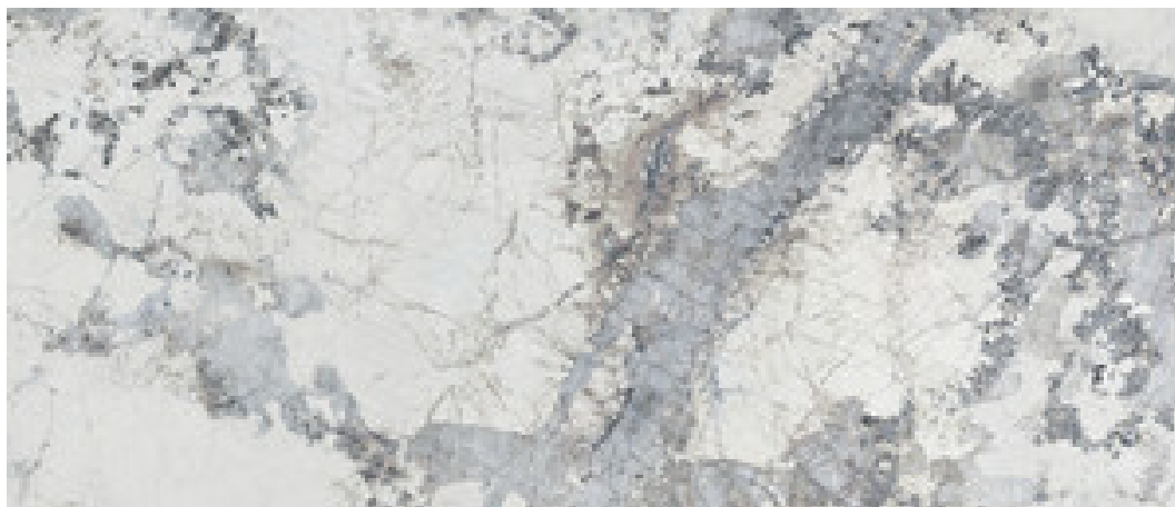
BLUE PULIDO 120X280 RC G.196 | Polished | Coloured body Rectified.