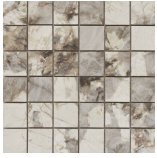
MOSAICO GOLD PULIDO PREMIUM 30x30 SP2037 | Premium polished |