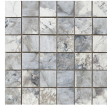
MOSAICO BLUE PULIDO PREMIUM 30x30 SP2037 | Premium polished |