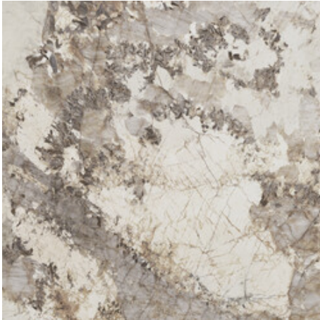
GOLD PULIDO 120x120 RC G.192 | Polished | Neutral Body Rectified.