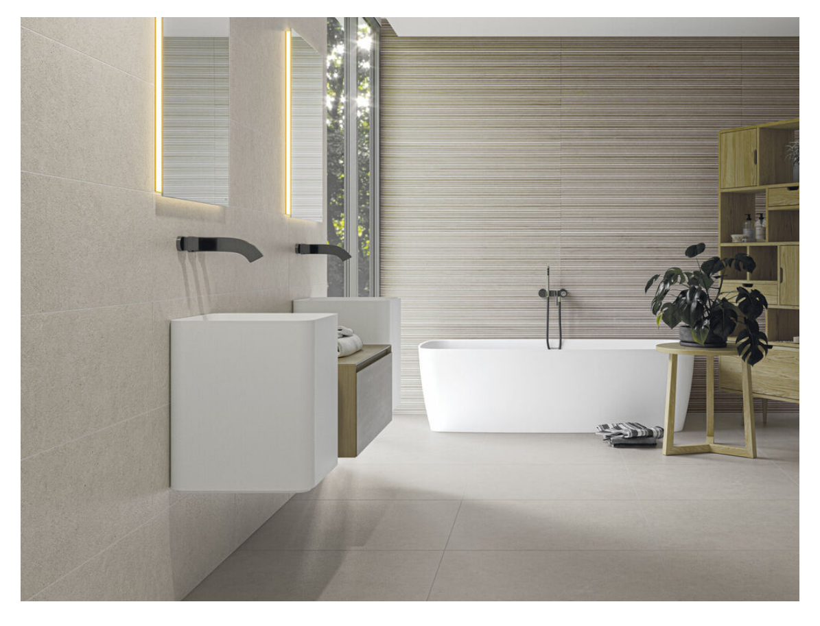
The results shown represent an indicative approximation. This document does not constitute a contractual relationship. To place orders or check product availability, please contact the company.