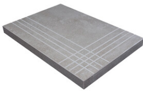
PELDAÑO ANGULO GRADONE RECTO 30X60 | 30X60 / 12"x24"