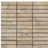
ARCATA STONE TESELA BEIGE MATE 30x30 ANTISLIP SP2039 | MATT |