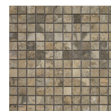
ARCATA STONE MALLA TERRA MATE 30x30 ANTISLIP SP2037 | MATT |