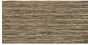
RELIEVE ARCATA STONE TERRA MATE 30x60 SL G.64 | MATT | Neutrale Scherben