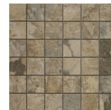
ARCATA STONE MOSAICO TERRA MATE 30x30 ANTISLIP SP2037 | MATT |