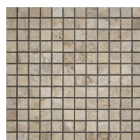
ARCATA STONE MALLA BEIGE 30x30 ANTISLIP SP2037 | MATT |