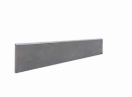
RODAPIÉ 7,5X60 | 30X60 / 12"x24"