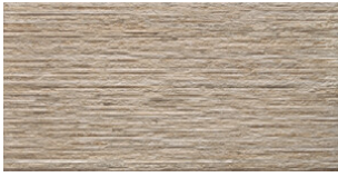
RELIEVE ARCATA STONE BEIGE MATE 30x60 SL G.64 | MATT | Neutrale Scherben