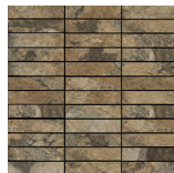
ARCATA STONE TESELA TERRA MATE 30x30 ANTISLIP SP2039 | MATT |