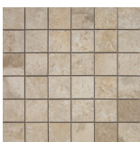
ARCATA STONE MOSAICO BEIGE 30x30 ANTISLIP SP2037 | MATT |