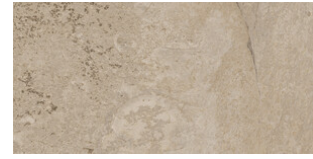
ARCATA STONE BEIGE MATE 30x60 SL ANTISLIP G.64 | MATT | Neutrale Scherben